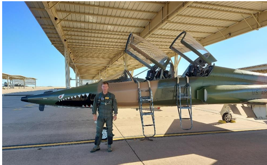
Picture taken by the T-38 C Talon, the United States Air Force jet trainer aircraft, Texas, USA

We love to hear from any of our ex-students as to what they have achieved since leaving Beths so, please do keep us updated!