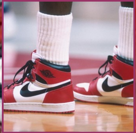
Michael Jordan's first ever sneaker