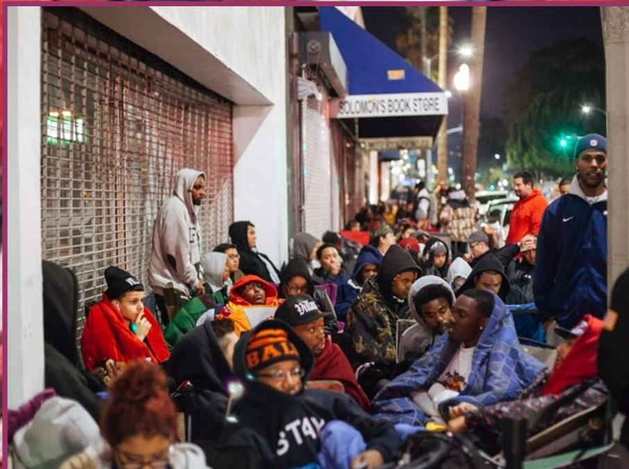
This shows how many people are willing to camp out, to get a new pair of sneakers.