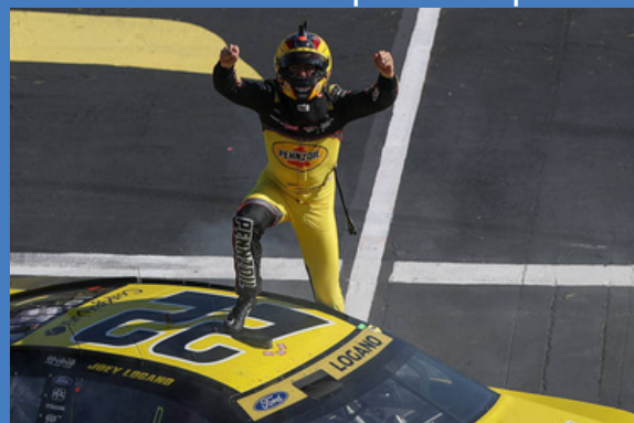
Joey Logano, driver of the #22 Pennzoil/Team Penske Ford, celebrates after winning the 2024 NASCAR Cup Series South Point 400 from Las Vegas Motor Speedway on October 20 2024 in Las Vegas, Nevada.

While Logano made it to the Championship 4, he would be up against Tyler Reddick (#45 23XI Racing) , teammate Ryan Blaney (#12 Team Penske) and William Byron (#24 Hendrick Motorsports) in Phoenix.