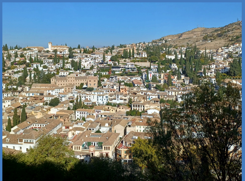
The view from the Alhambra