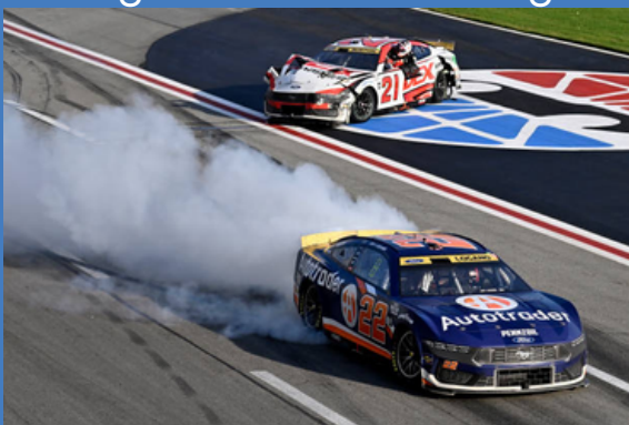
Joey Logano, driver of the #22 Autotrader/Team Penske Ford, celebrates with a burnout after winning the NASCAR Cup Series Quaker State 400 available at Walmart from Atlanta Motor Speedway on September 27 2024 in Hampton, Georgia.

Late in the race, Logano battled Tyler Reddick (#45 23XI Racing) for the last transfer spot the Round of 8, but came up short - he would be eliminated from the Playoffs... until he wasn't. This is because Alex Bowman's (#48 Hendrick Motorsports) Chevrolet had failed to meet minimum weight requirements during post-race inspection, resulting in his disqualification. Bowman, who initially made the Round of 8, was demoted to a last-place finish and dropped from the Playoffs. Joey Logano ended up being the beneficiary and would advance after all. He made the most of his second chance immediately, after stretching his fuel mileage to win at Las Vegas and lock into the Championship 4.